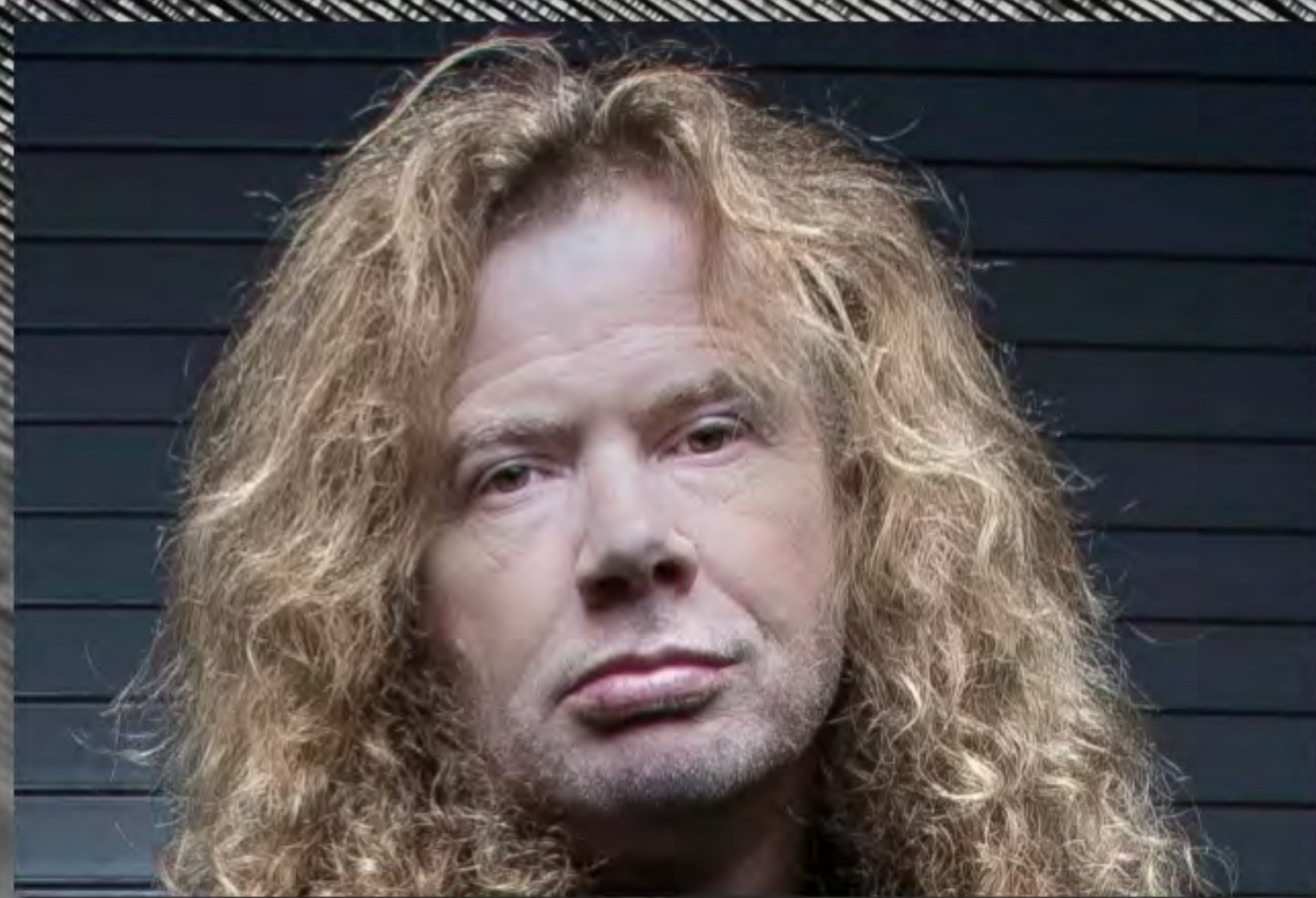
MEGADETH'S Dave Mustaine talking to VINYLTHON 2019

“If I was forced to pick my top three vinyl albums, I would probably pick some old classics, because of the tonality of the instruments back then and a lot of the analog amplifiers, as well as the analog consoles and analog recording devices. Same thing with the analog microphones. So, probably ‘The White Album’ from THE BEATLES. Probably ‘Wish You Were Here’ from PINK FLOYD, or ‘The Dark Side Of The Moon’, which is another great album for sounds like that. And most definitely, because it’s very personal to me, AC/DC ‘Let There Be Rock’. And, like I said, to me, all of the analog equipment had a really warm sound. And, of course, you needed to have a great stereo and playback system to make it all come together. But if you were that critical about all those parts in the series, then you already had a great-sounding stereo.”